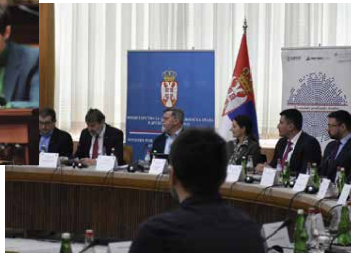
Social dialogue Philanthropy as giving for the common good - Enhancing the enabling framework 5 March 2024