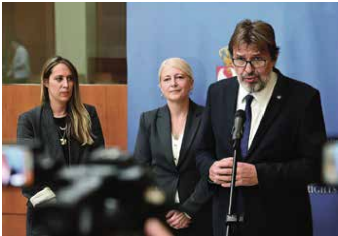
Social dialogue Including women and girls in technological and social innovation- challenges in institutional framework development 25 October 2023

From 2021 to July 2024, the Ministry of Human and Minority Rights and Social Dialogue conducted several social dialogues on gender equality to define strategic legal solutions in the area of gender equality in the sphere of economy (labour market, entrepreneurship, agriculture and village), gender equality in the field of education (teaching and learning curricula), social and health protection, equal opportunities for access to goods and services, as well as participation in political action and public affairs.