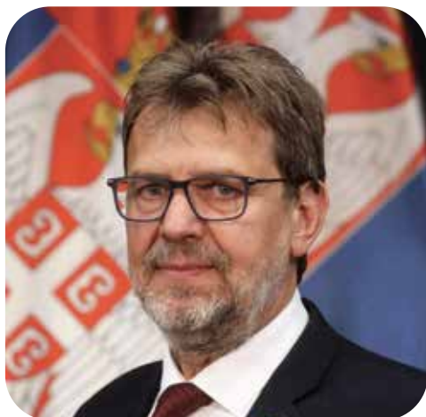
Tomislav Žigmanov Minister of Human and Minority Rights and Social Dialogue