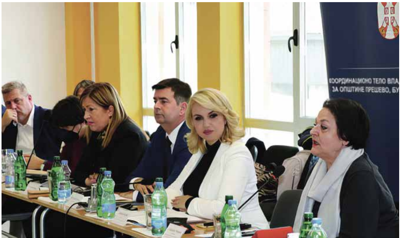
Social dialogue The 7-point Plan- integration into governmental institutions 11 March 2022

Firmly believing that social dialogue is the best way to solve problems and establish trust between representatives of Albanians and the institutions of the Republic of Serbia, the Ministry of Human and Minority Rights and Social Dialogue, in cooperation with the Coordination Body of the Government of the Republic of Serbia for the municipalities of Presevo, Bujanovac and Medvedja, initiated social dialogues on the topic of implementing measures for the affirmation of the rights of the Albanian national minority defined in the 7-point Plan adopted in 2013.