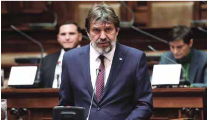
Social dialogue International Human Rights Day - Leave no one behind 10 December 2022

The dialogues encompassed discussions on a wide variety of topics in the field of human rights protection - such as the situation in the area of gender equality, anti-discrimination, same-sex unions, education and upbringing development strategy, social protection, strengthening the position of Roma men and women, the culture of dialogue, sustainable development goals, social entrepreneurship, intergenerational solidarity, additional psychological and psychiatric services, decent work in the media and responsible journalism. The conducted social dialogues were media-covered with the participation of a large number of representatives of different types of media outlets.