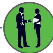
CONSENSUS FOR ACTIONS